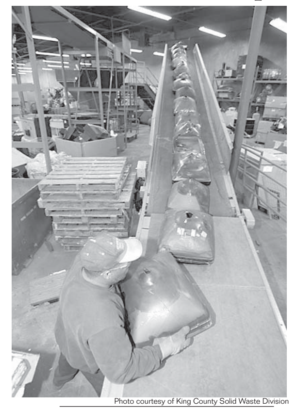
TVs being recycled at Total Reclaim, a member of the Take It Back Network.

King and Snohomish Counties have developed a solution today, one that won't hinder a transition to manufacturer responsibility tomorrow. These jurisdictions are partnering with retailers, recyclers, non-profits, repair shops and even a computer network services company, all of which take back certain electronics for reuse or recycling. As an interim program to a statewide or national system financed by manufacturers, the businesses charge an end-of-life fee for the collection and processing of the products. Both Counties require that certain standards for responsible recycling are met prior to admittance into the network. Further information can be found at